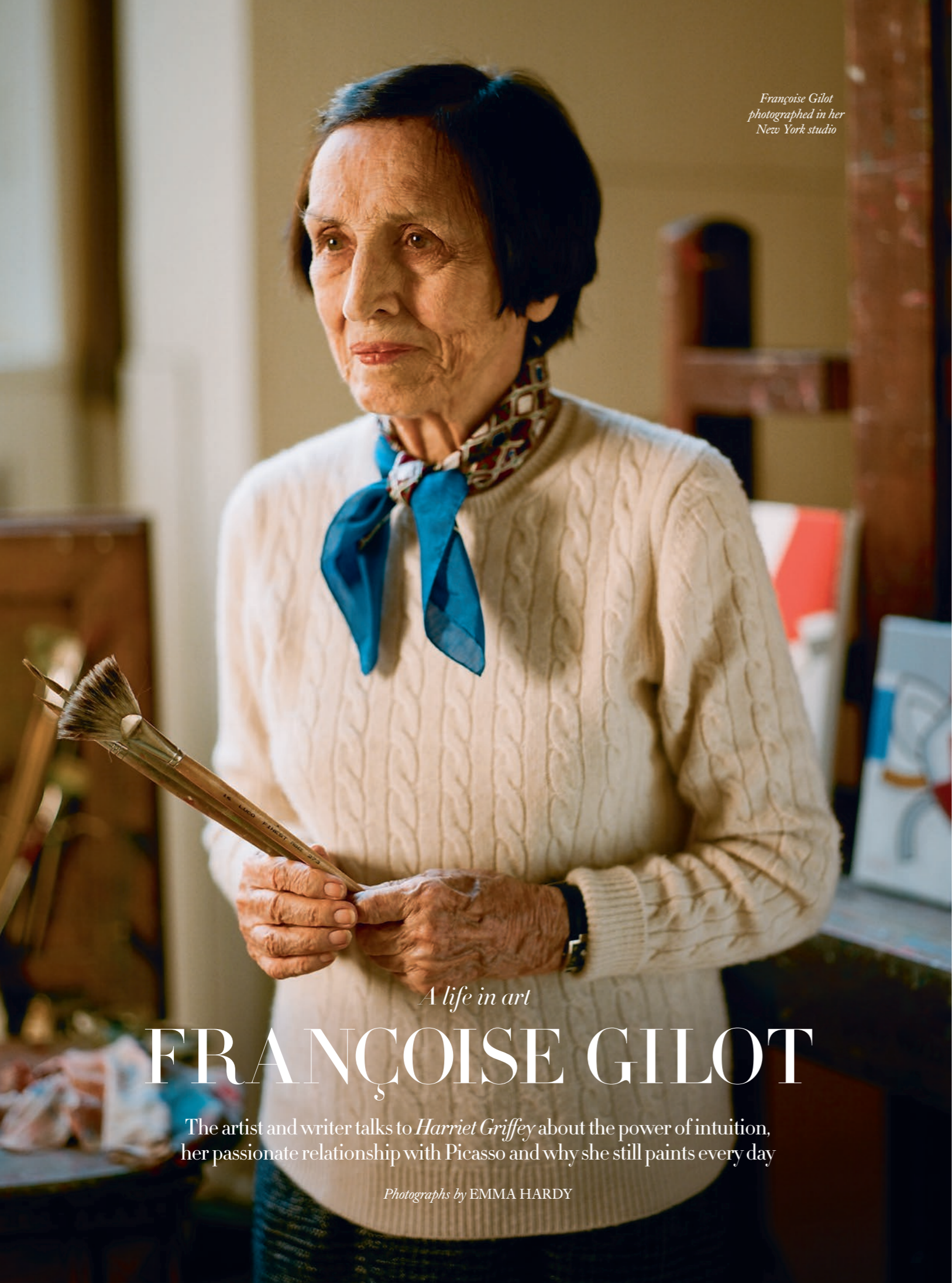
Françoise Gilot photographed in her New York studio