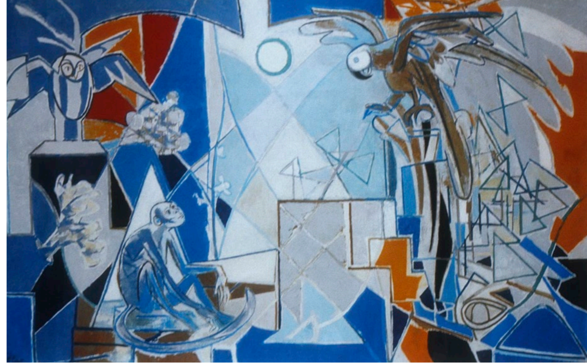
Left: 'Cyclical Space' (1966). Bottom: 'Paloma Asleep' (1950)

ALL ARTWORKS COPYRIGHT FRANÇOISE GILOT, 2019.