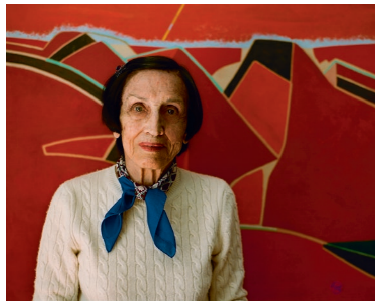
Clockwise from left: Gilot with her children Claude and Paloma, photographed by Lee Miller in France in 1953. 'Geometry' (2012). Gilot with her 1991 artwork 'Mountain Range'